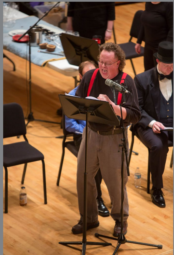
IPR’s Radio Drama “A Christmas Carol” drew a crowd of nearly 300 at Sursa Performance Hall on Ball State’s campus.