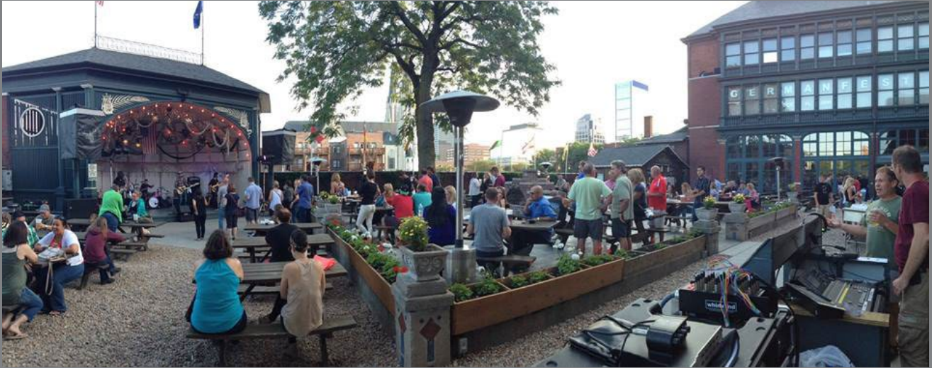
The Scene crew recording a live event at the Rathskeller Biergarten in Indianapolis.