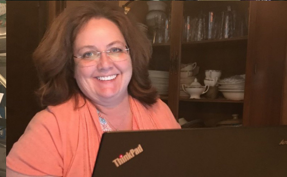
When the COVID-19 pandemic hit, the IPR staff began working from home.