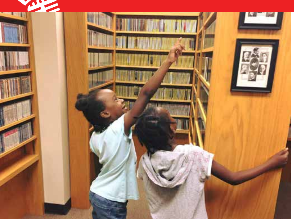
Students from Motivate Our Minds get special access to IPR's music library.