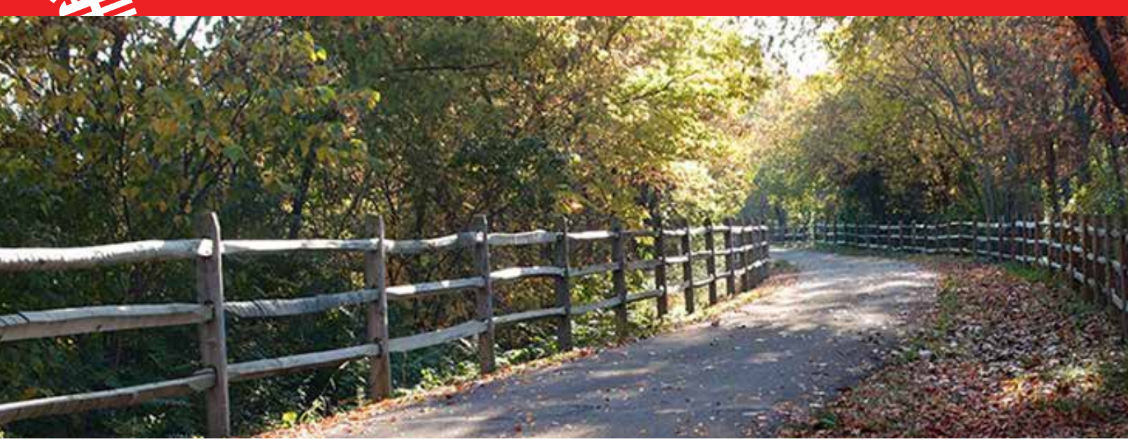
The Cardinal Greenway, featured in Community Connection.