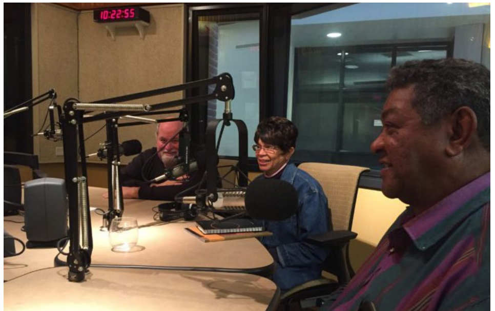
Members of Whitely Pantry are interviewed for Community Connection.