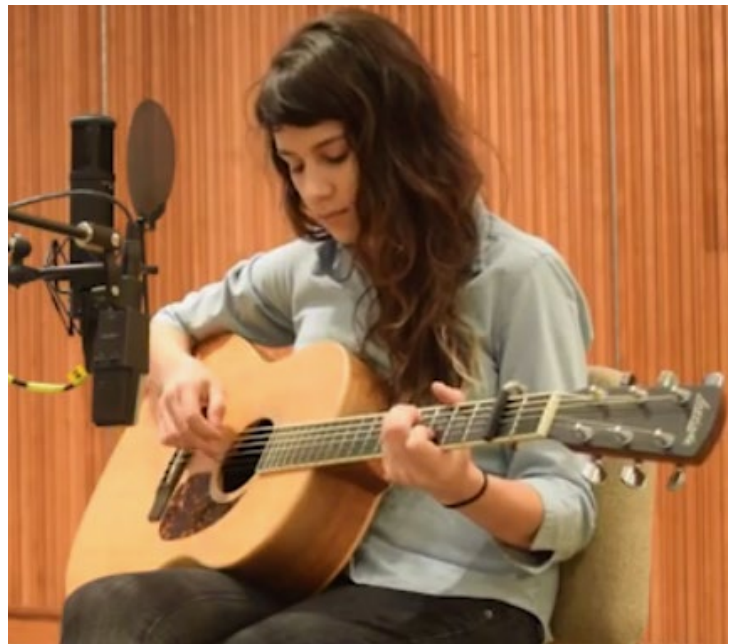
One of the many artists featured on The Scene .

In 2016, The Scene , produced in collaboration with the music media production class in Ball State University's School of Music, continued to highlight the local music scene monthly. Created in 2010, the music program features live performances and interviews captured at venues around Central Indiana. Each episode, which airs on Saturday evening, consists of two live sets produced by students.